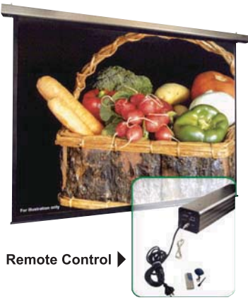
Remote Control ▶